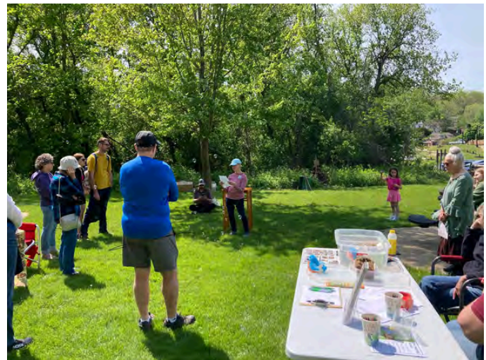
World Migratory Bird Day Event